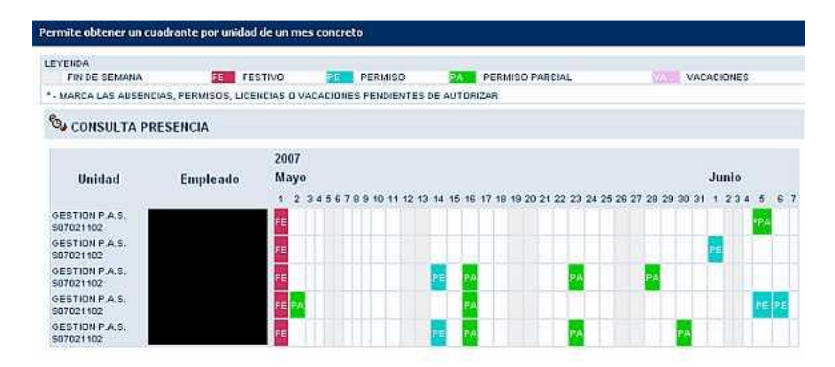
Figure 9: Report of time attendance

Lastly, the e-HRM of the UA allows supervisors to generate on-demand reports. Supervisors can review the time attendance of a particular employee or can check the balance of all the members of a work group. For example, Figure 9 shows a report about the time attendance and time off requests of five employees from May to June. Different colors are used to highlight the special events, such as bank holidays, employee holidays and full and part-time time offs. It is easy to see and compare the dates of attendance and time off of every person, thus providing their supervisor with exact and relevant information concerning the work time of their employees.