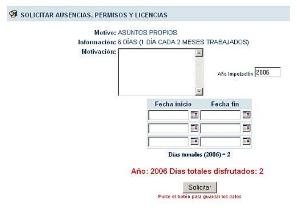
Figure 5: Request of time off

On the other hand, employees can make time off requests and enter time off taken through the e-HRM of the UA. Figure 5 shows the interface of this function, where the employee has to fill up the reason and the starting date and ending date of the time off.